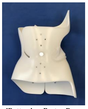
iButton in a Boston Brace

As part of our commitment to help patients succeed, we provide the iButton in all Scoliosis braces at no additional charge.